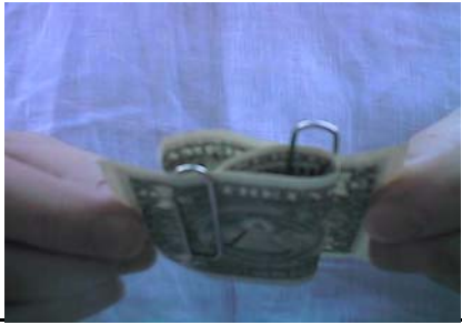
Paper Clip Link-Up