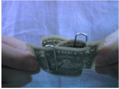
Paper Clip Link-Up