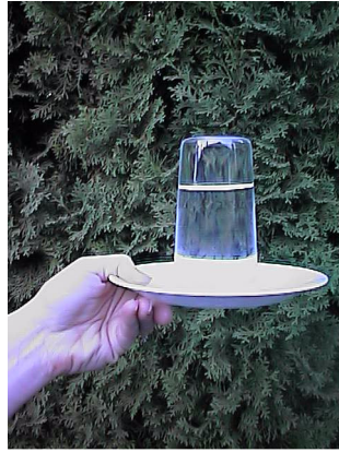
Don't Get Wet!